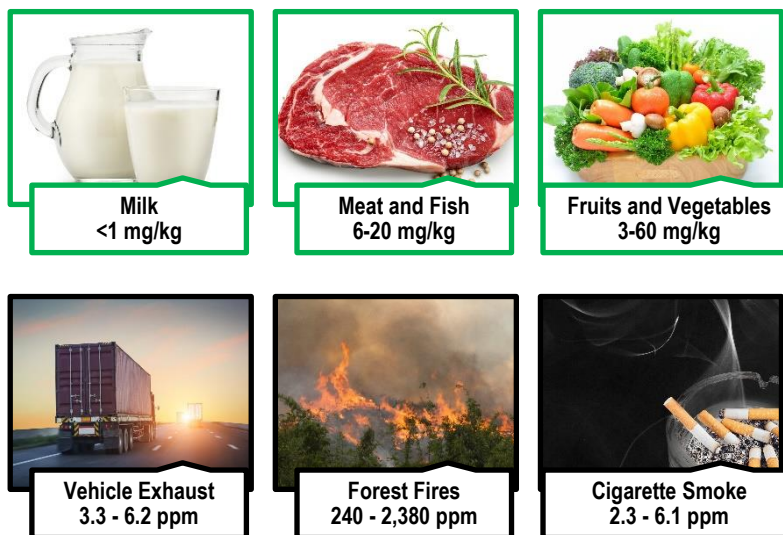
Figure 1: Concentration of natural formaldehyde found in common foods (green) and environmental sources (black). 3,4,5,6

Formaldehyde is a chemical found naturally in the environment. It is also an intermediate in many reactions and is found in most living beings. Foods such as fruits, vegetables, milk, meat and fish all contain small amounts of formaldehyde. Formaldehyde is also a product of the incomplete combustion of carbon, meaning it is found in vehicle exhaust, forest fires and cigarette smoke. 2