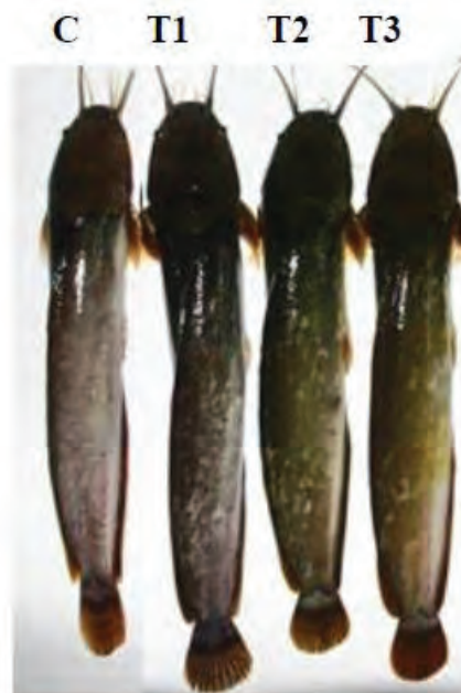
Figure 1: Digital image of hybrid catfish fed with experimental diets over 12 weeks: (C) Control, (T1) 0.5 kg/t ButiPEARL, (T2) 0.7 kg/t Quantum GLO Y and (T3) 0.5 kg/t ButiPEARL + 0.7 kg/t Quantum GLO Y.

to the control diet at 0.5 kg/t significantly improved the body weight gain by 95.81 g ( p < 0.05 ) with an FCR improvement of 25 points ( p < 0.05 ). This group also gave the best specific growth rate among other groups. However, growth performance of the ButiPEARL™ + Quantum GLO™ Y fed group was not significant different from the Quantum GLO™ Y fed group ( p > 0.05 ).